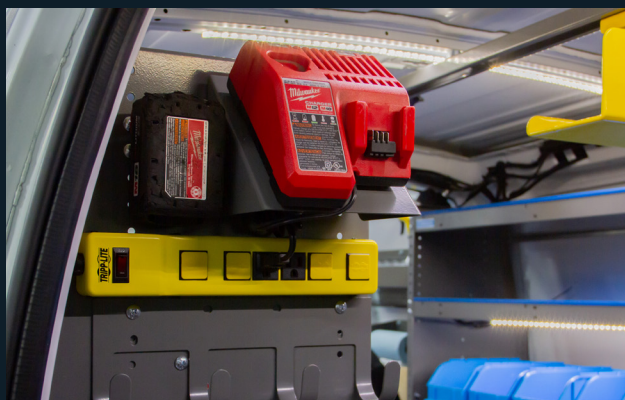
BATTERY CHARGING STATION