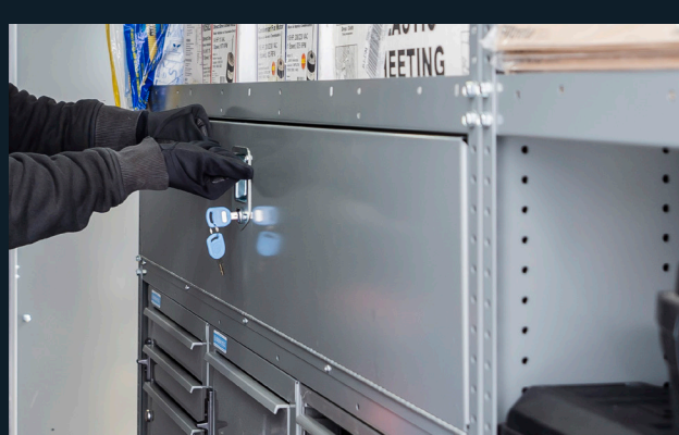
DOOR KITS & DRAWERS