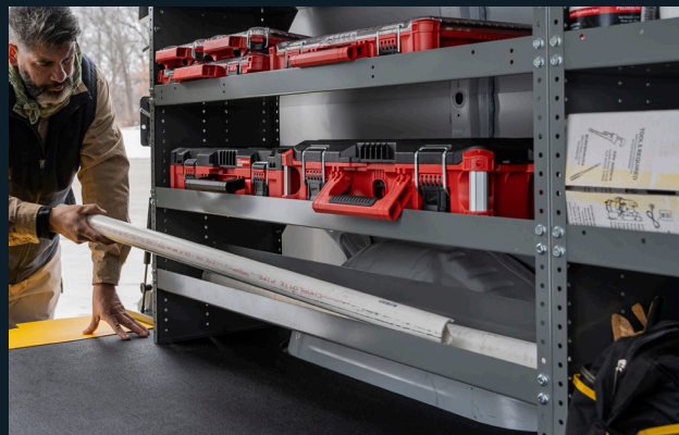
WHEELWELL PIPE TRAY