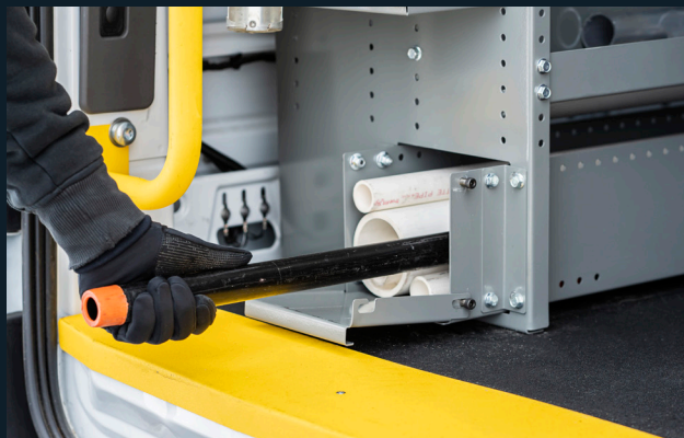
UNDERSHELF 10' CONDUIT TRAY